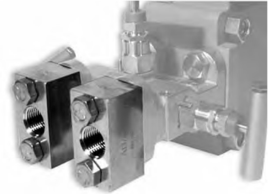
Flange seal and mounting bolts are included